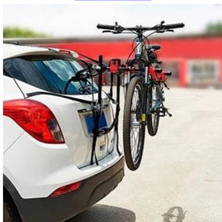
Bike Rack Car