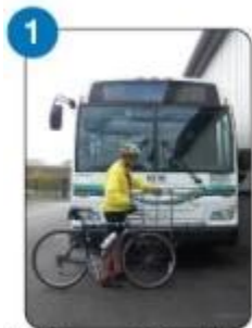
1 Holding your bike with one hand, grab rack handle.