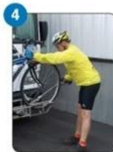
4 Pull support arm out, up, and over front tire.