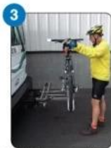
3 Lift bike into rack with front tire facing the support arm.