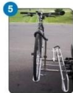
5 Your bike is ready to go.