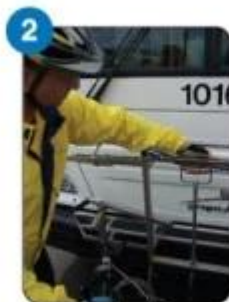
2 Squeeze handle and pull rack down.